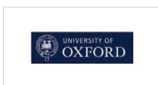
University of Oxford