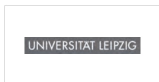
University of Leipzig