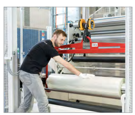
1.25 meter wide film substrate on the roll-to-roll coating line atmoFlex 1250 Picture in printable resolution: www.fep.fraunhofer.de/press

PRESS RELEASE February 12, 2019 | Page 4 / 5