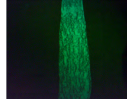
Fluorescence of a lacquer strip © Fraunhofer IAP Picture in printable resolution: www.fep.fraunhofer.de/press

Fraunhofer IAP, IGB und FEP at ICE europe 2019