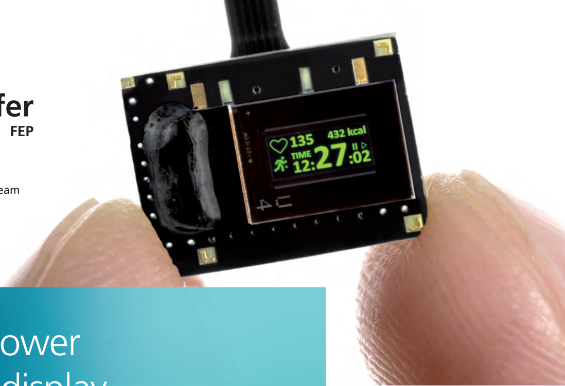
Ultra-low-power OLED microdisplay